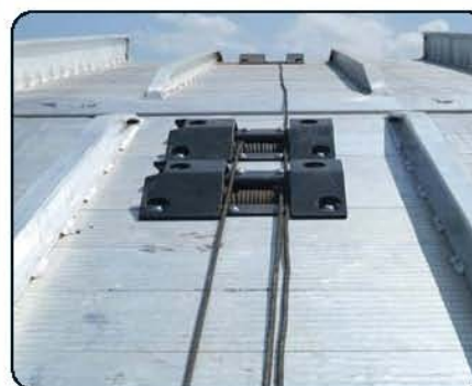
One Winch per Vehicle Upper and Lower Deck