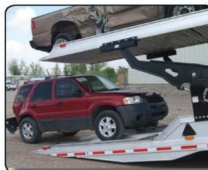
Adequate Clearance on Wide Variety of Vehicles

*Capacity ratings are frame capacities only. Actual load capacities may be restricted by factors such as gross axle weight ratings (GAWR) or state and federal regulations.