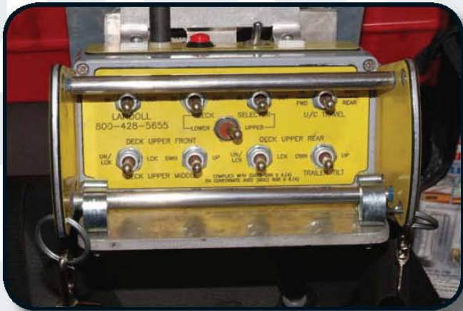
➤ Cordless Hydraulic Controls