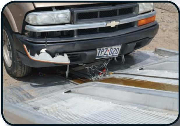
➤ Rugged Guide Rails on Lower and Upper Decks