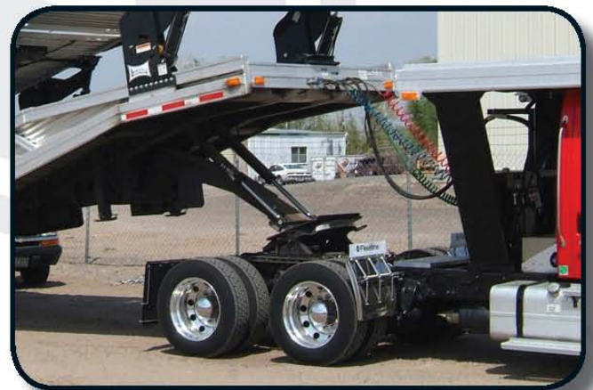
➤ Tilt Cylinder - Major Steel Components Powder Coated