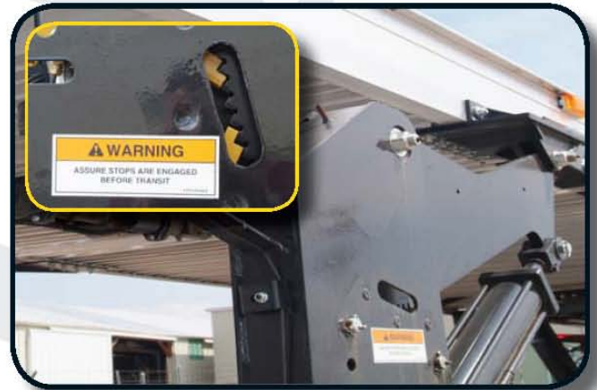
➤ Hydraulic Adjustable 24" Vertical Travel