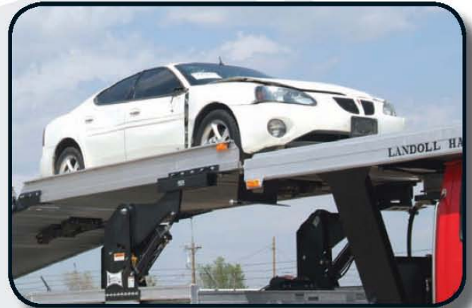
➤ The Adjustable Upper Deck Allows for Easy Transition from Trailer to Overcab