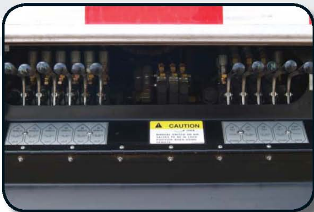
➤ Manual Hydraulic Controls