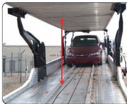
Maximum Clearance 81"