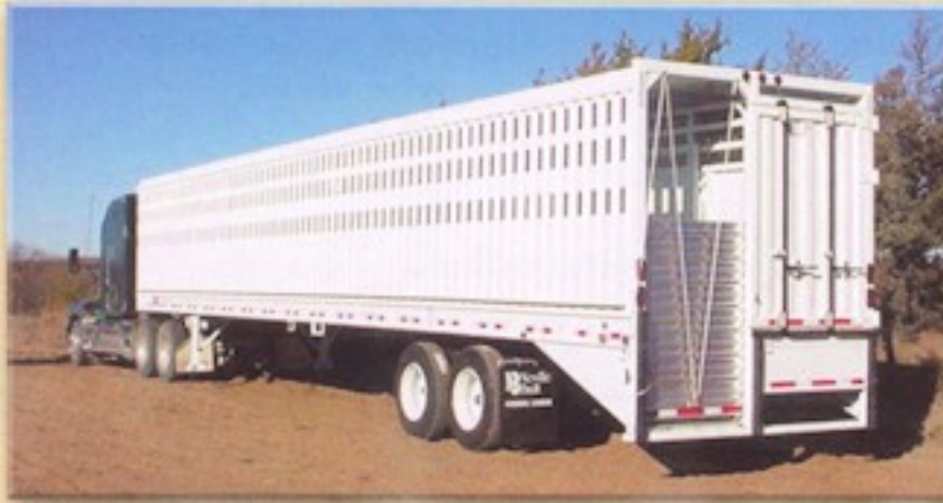
53' Ground Load (Options: Air-ride with slider and Punch Sides)