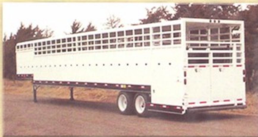
Full open rear option (6' rear box length is standard)

Available in lengths 35' to 57' with a width of 102"