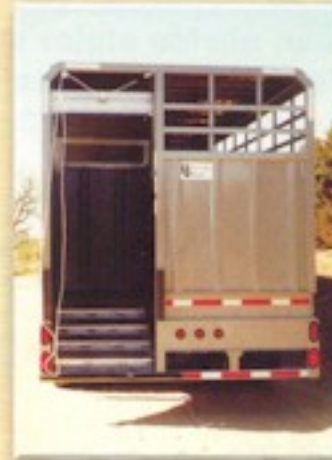
Ramp in Ground Load Position (14" entry height)