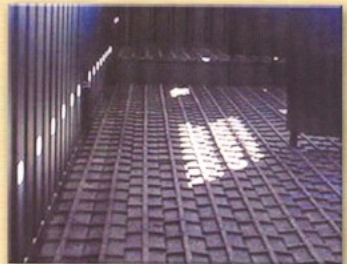
Standard rubber floor with cleats