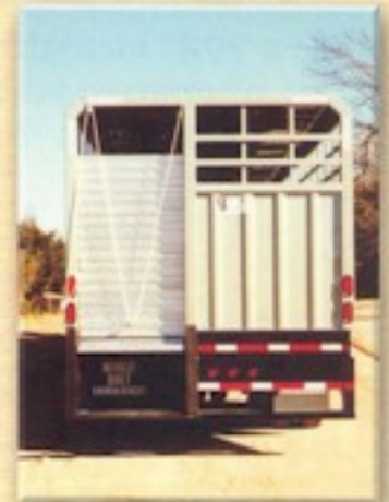
Ramp in Floor Position (40" entry height)

Neville Built Ground Load trailers have the exclusive feature of loading from the ground or raising the light weight aluminum ramp and loading from a standard height chute. This feature truly makes ours user friendly. (Patent #09-954,688)