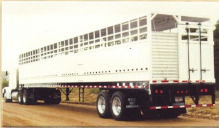
53' x 102" straight floor, airride slider suspension, aluminum wheels, full opening rear door, aluminum floor, empty weight 13,900#